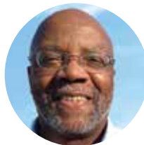
Joe James Agri-Tech Producers (ATP)

Vibrating Therapeutic Apparel (VTA) offers drug-free, wearable devices that use vibration therapy to help amputees and neuropathic pain sufferers manage pain so they can sleep better, feel better, and live better without the risk of drug dependence or side effects.