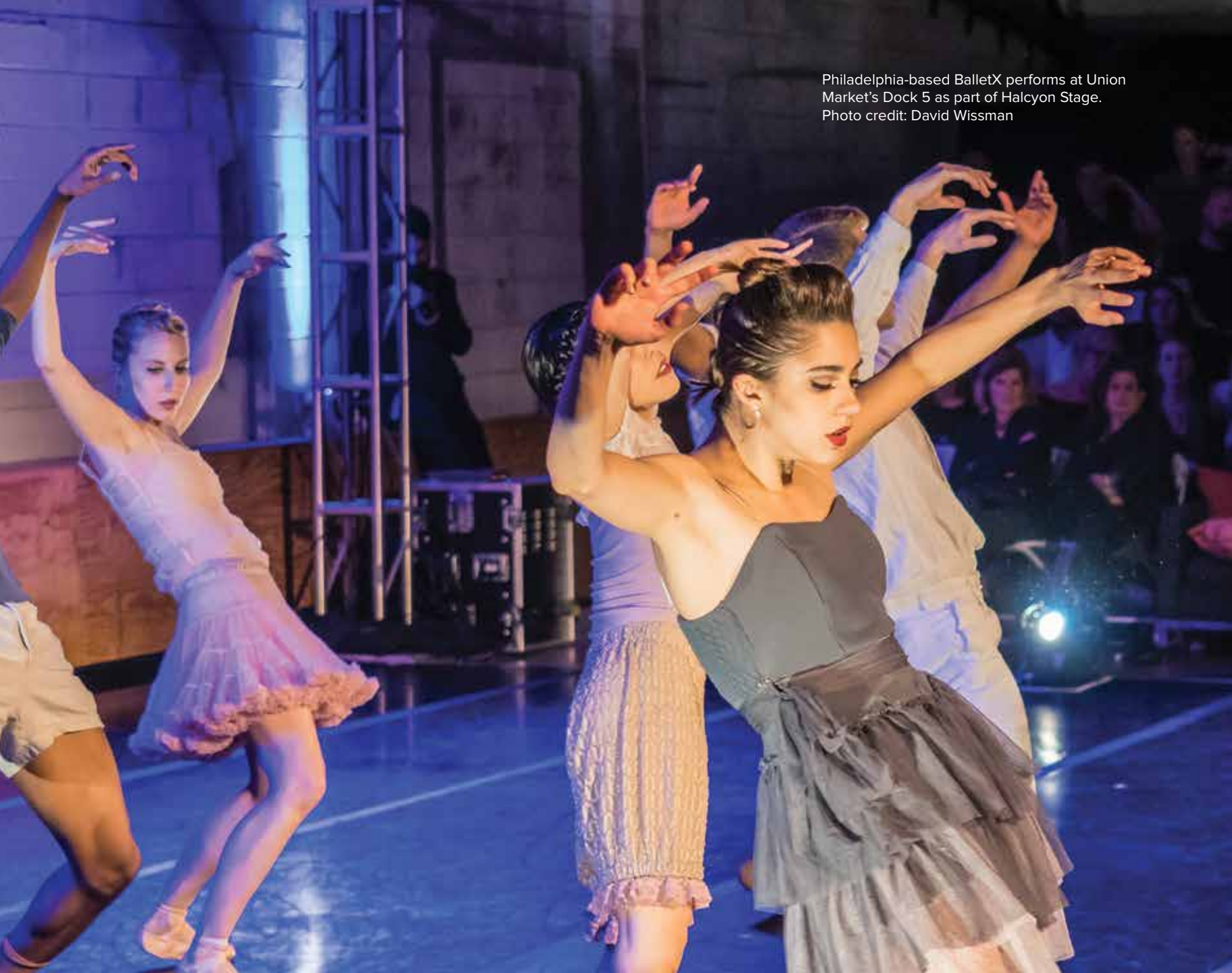
Philadelphia-based BalletX performs at Union Market's Dock 5 as part of Halcyon Stage.