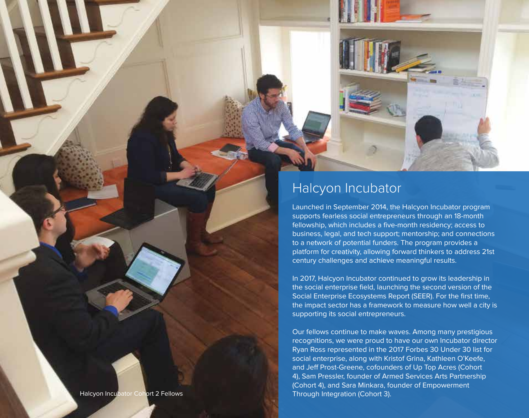
Halcyon Incubator Cohort 2 Fellows